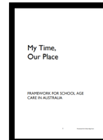
My Time, Our Place; Framework for School Age Care in Australia

Critical reflection: Reflective practices that focus on implications for equity and social justice ( Early Years Learning Framework – refer to Sources ).